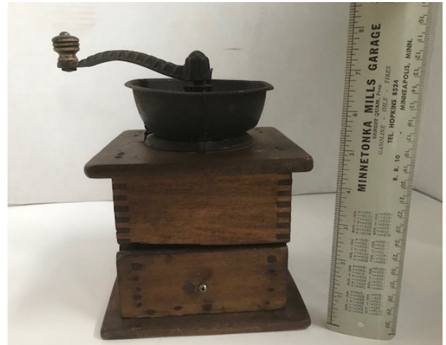
4. What was this iron and wooden artifact used for?