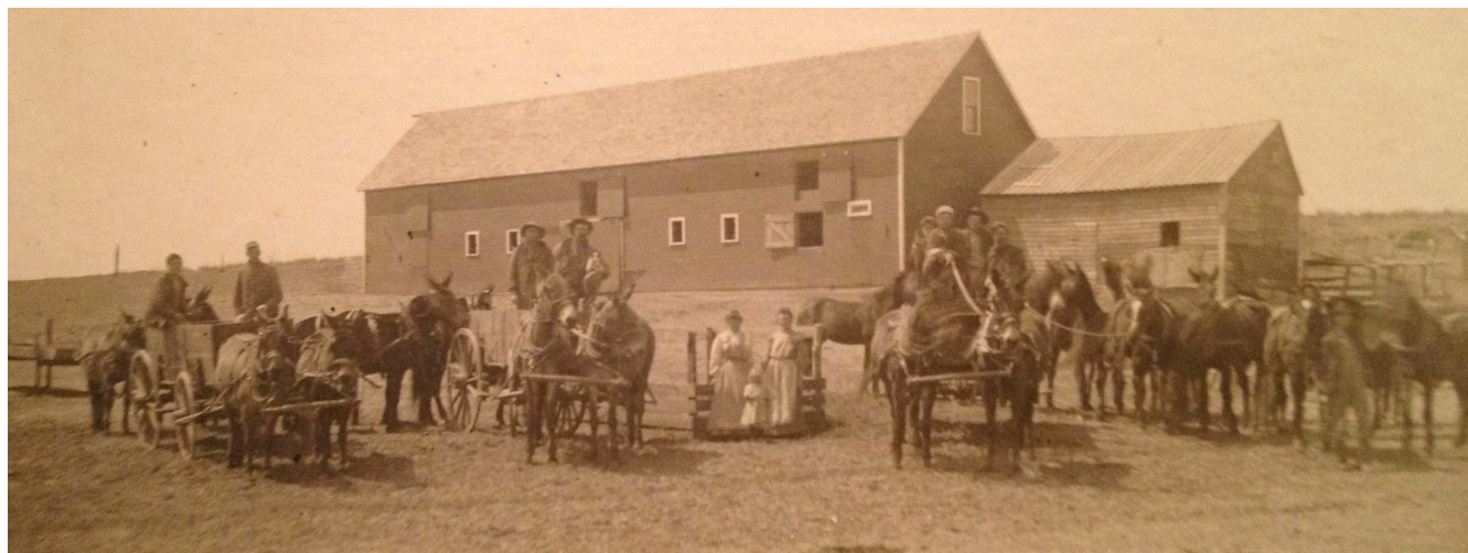
"Haying crew" on (Campbell's ?) Minnetonka Mills Farm in the 1890's near Inverness Road.

Please join us at the Minnetonka City Hall Community Room on May 8th at 7PM. Beverages and cookies will be provided as usual.