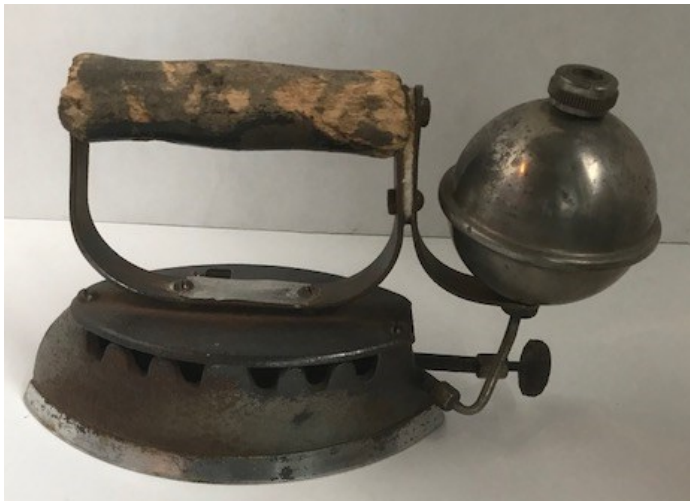
3. What was this 19th century "steam punk" artifact?