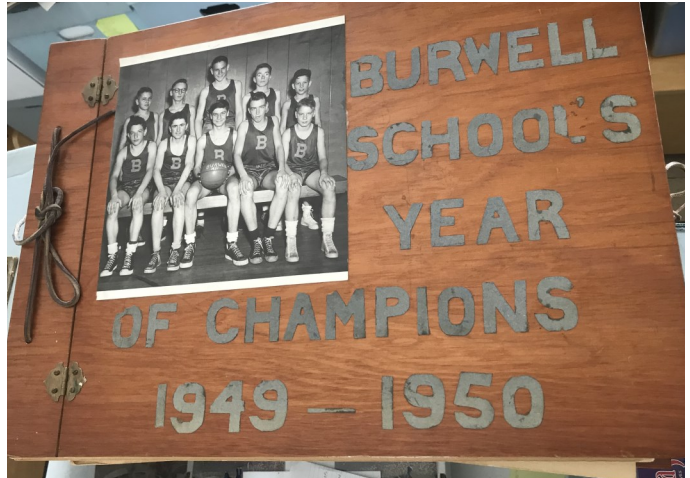
2. Who are these Minnetonka champions in this scrapbook?