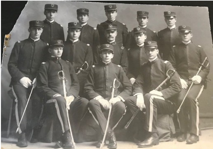
Mystery artifacts: 1 - Who are these Minnetonka Civil War veterans?